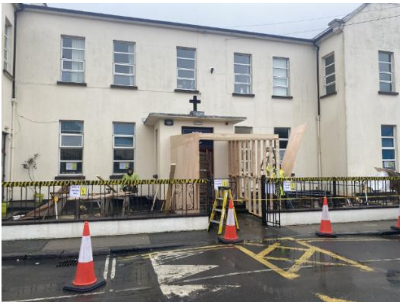
Work underway to get the monastery back up and running

Our thoughts and prayers go out to the families who are still without power and who have have serious damage to their homes.