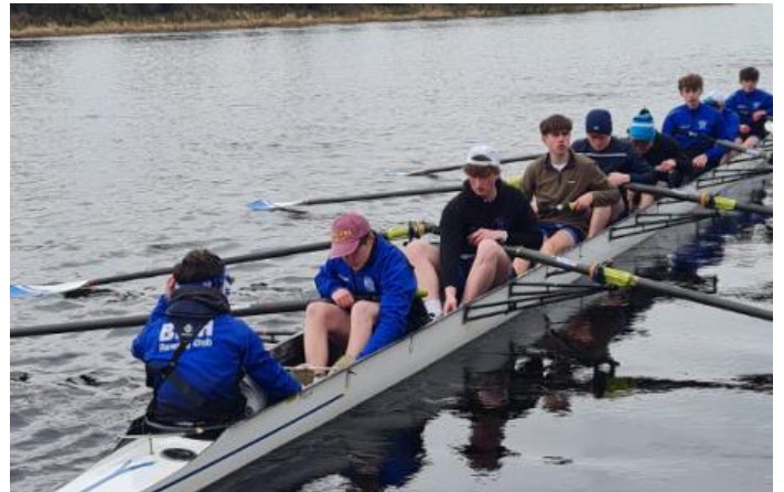
The J16 and J18 rowing crews travelled to St. Michaels HOR in Limerick. J16s came away with a win in the 4s and 8s, and J18s came 3rd in 8s.